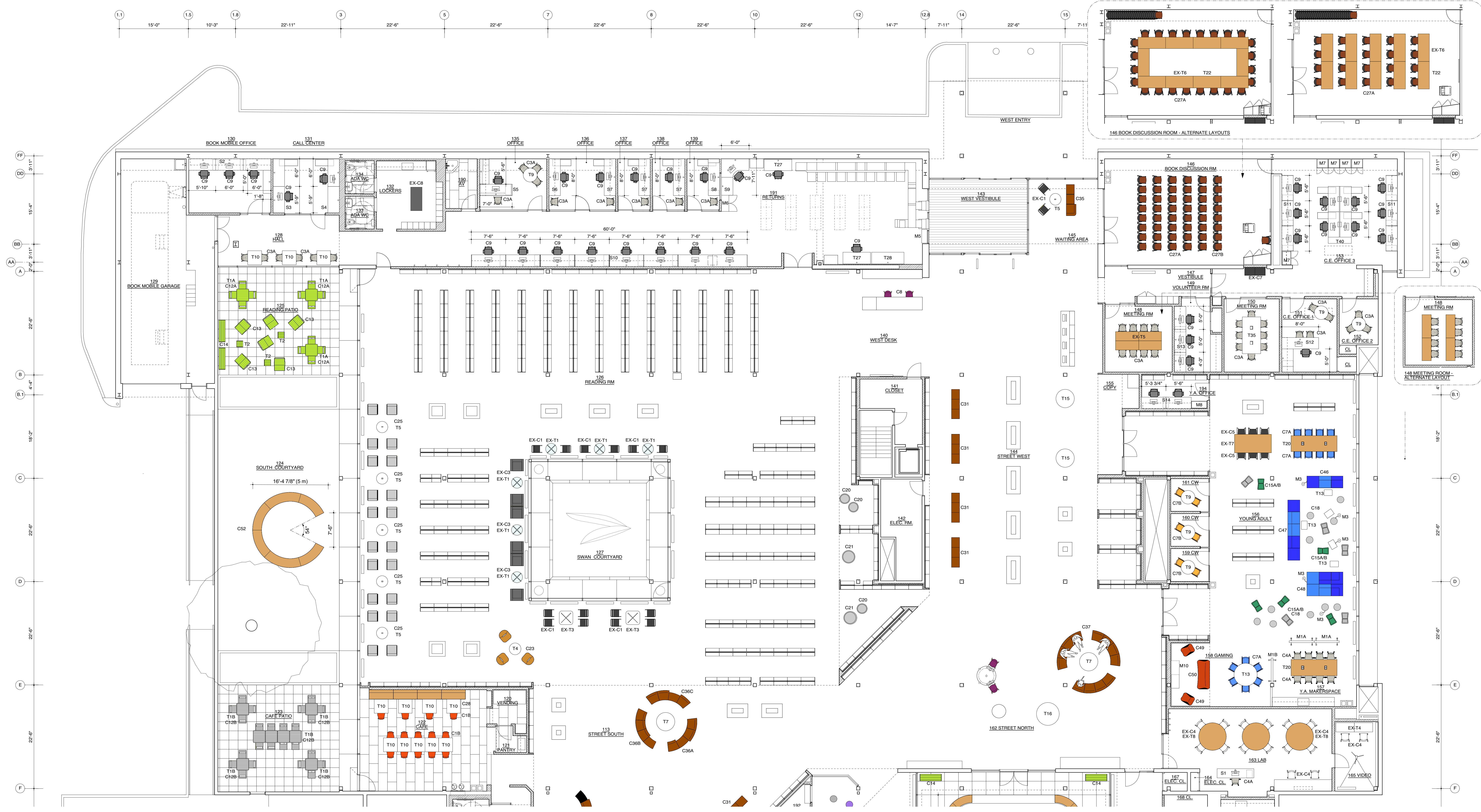
FURNITURE PLAN: GROUND FLOOR WEST 1/8" = 1'-0"