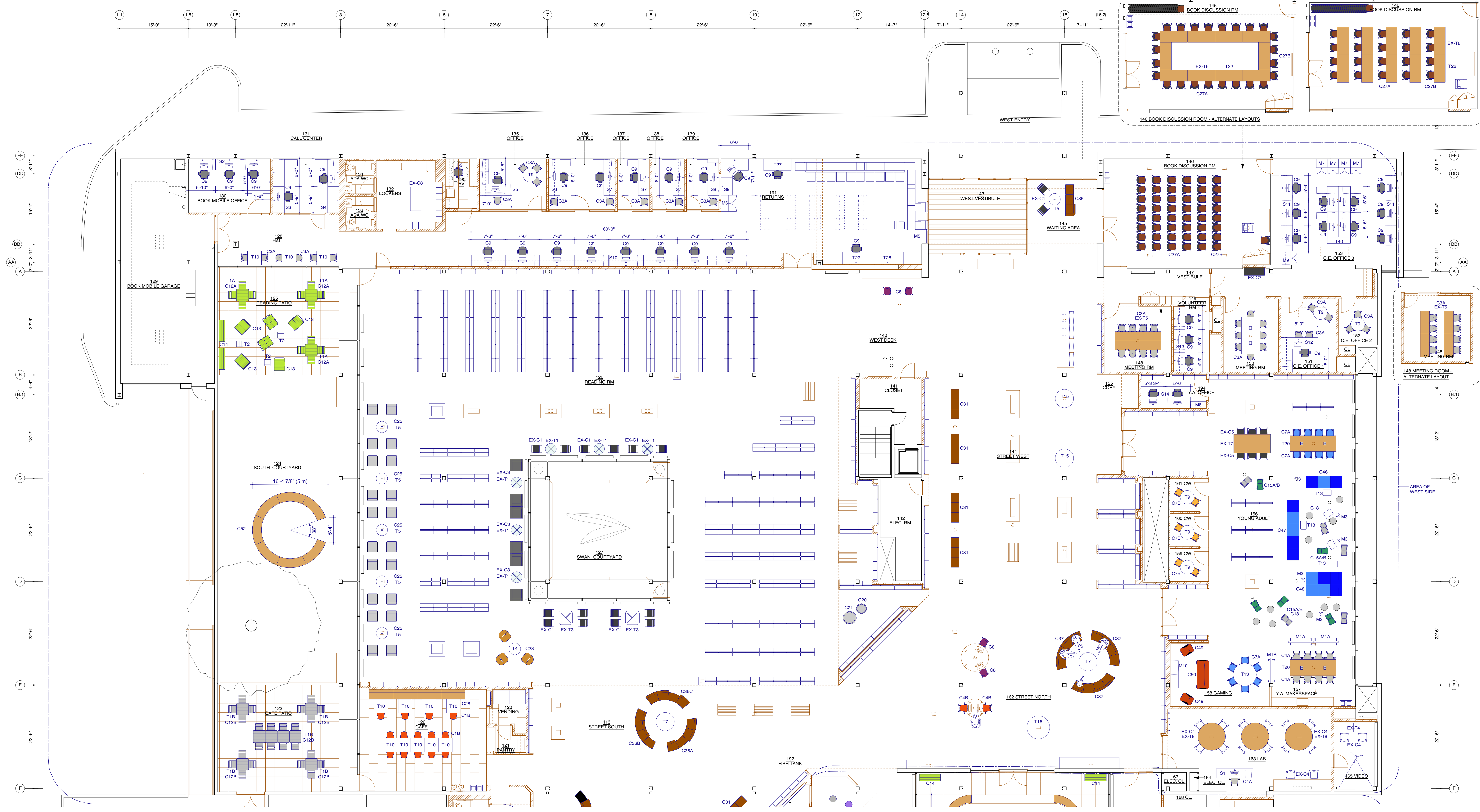
1 FURNITURE PLAN: GROUND FLOOR WEST 1/8" = 1'-0"